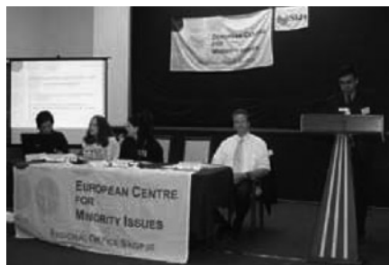
REGRI 4th joint meeting (Sep 2005)

Taking the foregoing into account, ECMI conducted the first global assessment of the needs of the Romani population of Macedonia in fall 2003. Preliminary background research for a similar project in Serbia and Montenegro was completed in winter 2004, with