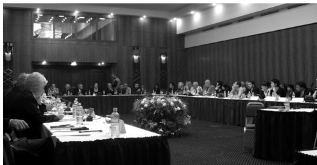
On 6 June 2005, ECMI held a conference entitled "Finding Durable Solutions for the Meskhetians" in Tbilisi, Georgia, as a part of a large-scale comparative research project "Between Integration and Resettlement: The Meskhetian Turks".

The workshop was organized in conjunction with a conference for major stakeholders involved with Meskhetian Turk issues in Georgia, i.e. government officials and representatives for international organizations and civil society. The conference took place on 6 June and was followed by a separate briefing of high-ranking officials from the Georgian government. The Georgian ministers for Conflict Resolution Issues, Refugees and Accommodation and Civic Integration attended the conference and subsequent briefing along with a range of other officials and parliamentarians. A press conference for local and foreign journalists was also held following the briefing. At these events, the ECMI research network experts informed Georgian officials, activists, scholars and other stakeholders involved in the solution of Meskhetian Turks' issues on the preliminary findings of the research project.