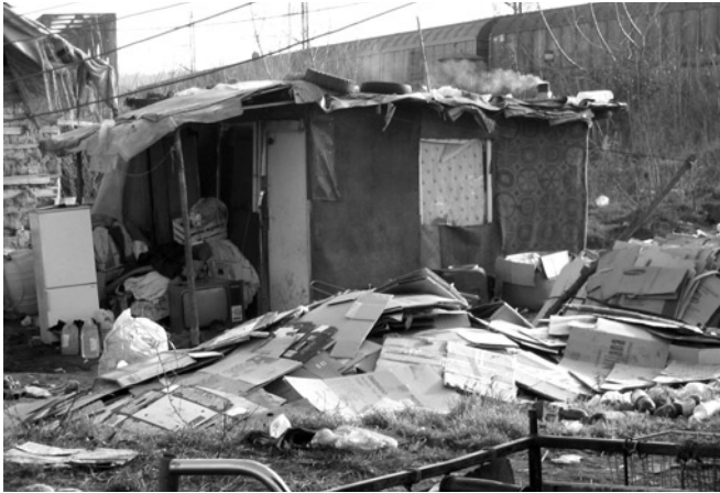
Scrap collection SR (2004): For some Roms, scraps constitute a chief form of income (Belgrade, fall 2004).

Gypsies under the previous regime. A result of underestimation of the size of the Romani population is overestimation on indicators such as birth rates, fertility, family size, and criminality among Roms.